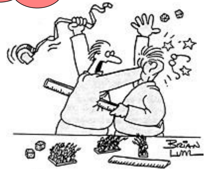
USING LOGIC AND REASON, ERNEST AND WENDELL SETTLE A RULES INTERPRETATION DISPUTE AT WEDNESDAY NIGHTS GAME.